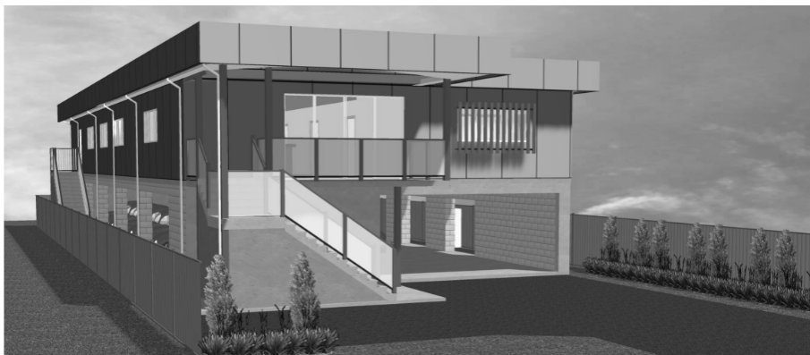
Figure 1 | Proposed Development

The project is a health services facility containing five (5) consulting rooms, two (2) procedure rooms, conference room, reception and waiting area, and associated amenities with carparking at the lower level.